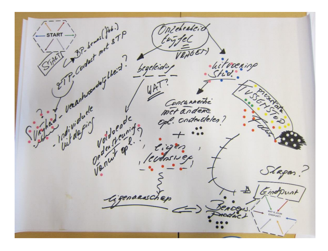
Figure 2. Example of a tutor map